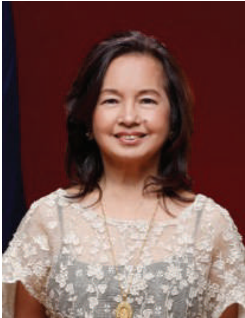
Former President Gloria Macapagal Arroyo

The Association for Philippines-China Understanding or APCU is a private association promoting friendship between the Philippines and China. I am the Chair Emeritus of APCU, which means honorary chair. During APCU's formative years, I helped formalize and register it with the Securities and Exchange Commission.